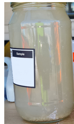
Site 1: 15 Sep 2022