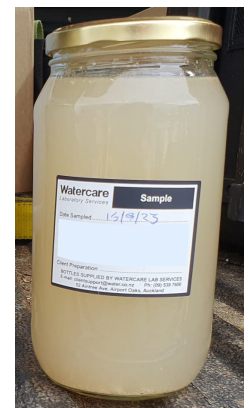
Site 1: 16 Sep 2023